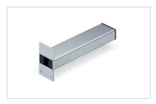
Schöck Stacon® Type LD-Q Part S Stainless steel sleeve for longitudinal and transverse deformations