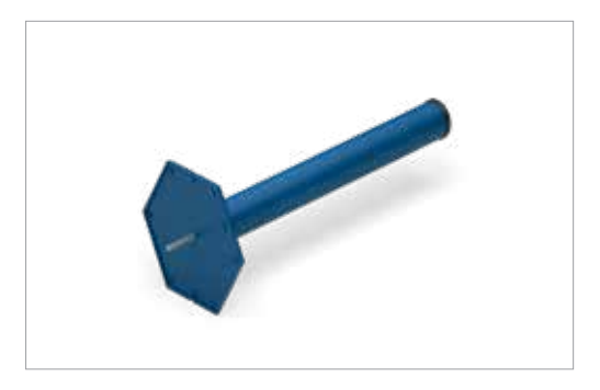
Schöck Stacon® Type LD Part P Plastic sleeve with nail plate for easy fixing to the formwork for use in construction joints