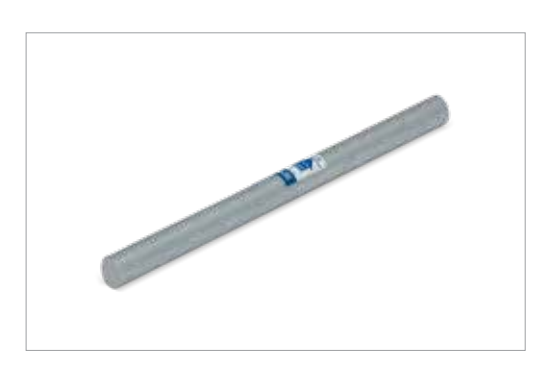
Schöck Stacon® Type LD Part ZN Dowel of galvanised, high-strength structural steel for indoor use