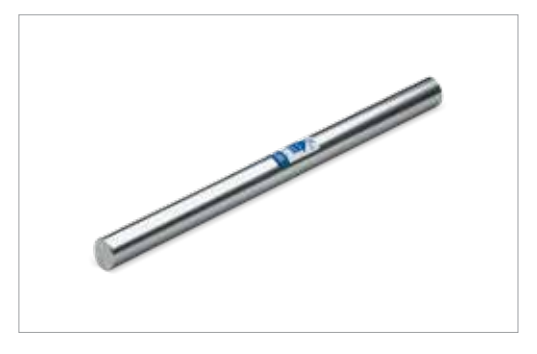
Schöck Stacon® Type LD Part A4 Dowel of high-strength stainless steel for outdoor use