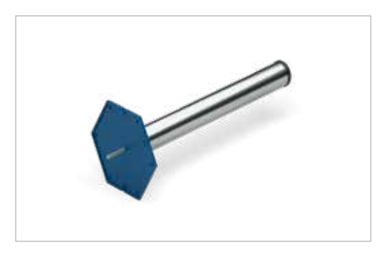
Schöck Stacon® Type LD Part S Stainless steel sleeve with nail plate for easy fixing to the formwork for use where frequent deformations are to be expected