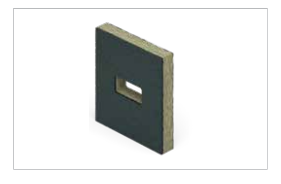
Schöck Stacon® Type LD BSM The fire protection collar is simply pushed onto the dowel