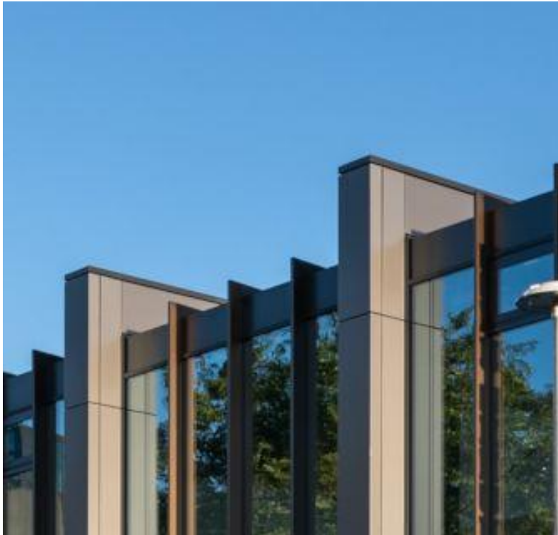
Support for the external cladding is provided by cantilever connections to the universal columns. Schöck Ltd, royalty free.