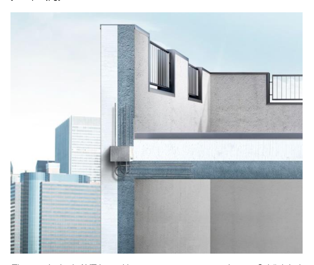
The new Isokorb AXT in position