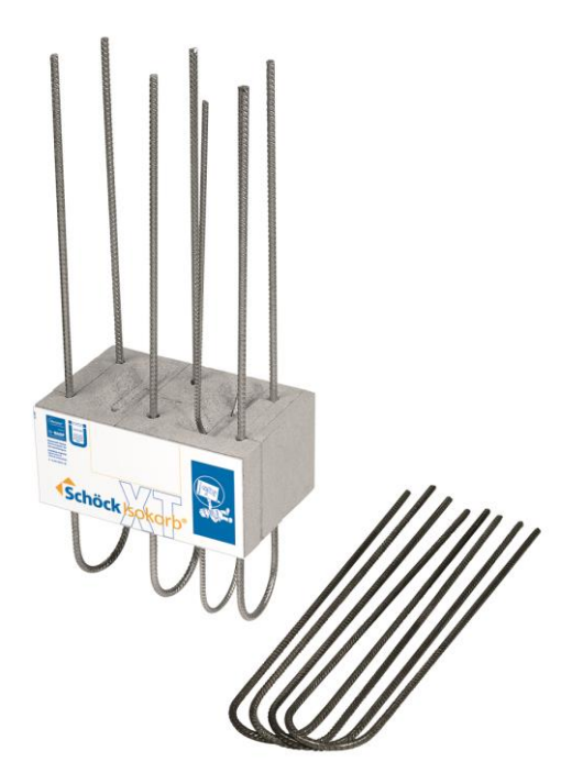
The new Schöck Isokorb type AXT