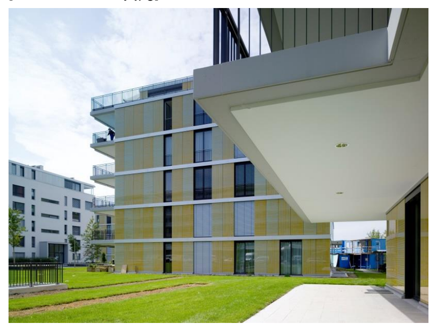
The Isokorb XT makes it possible for cantilever balcony construction to be built to passive house standards