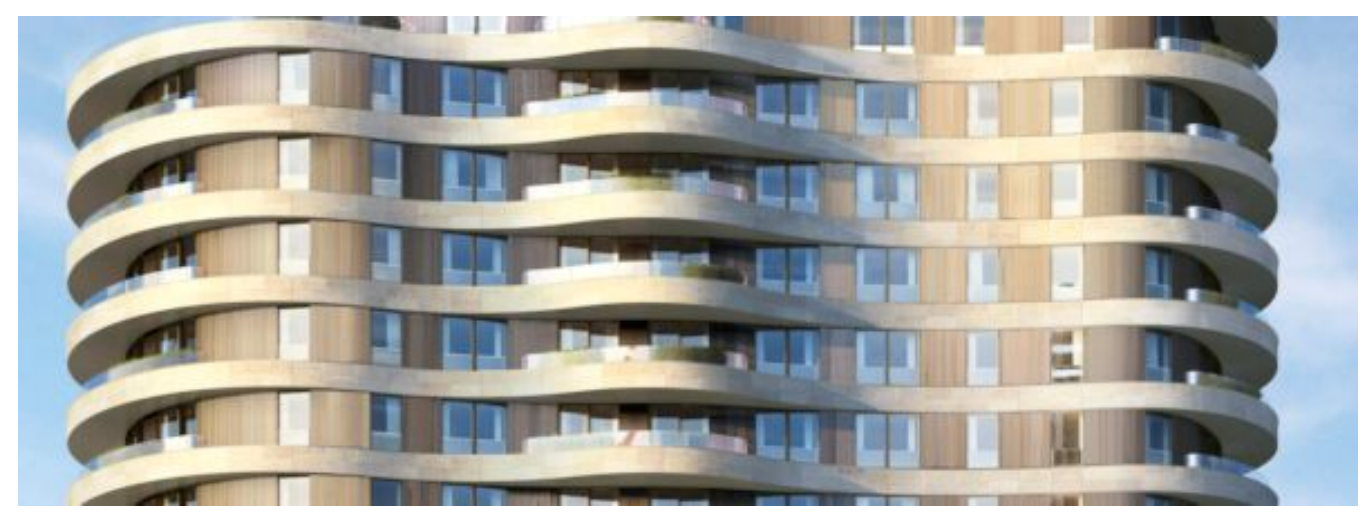
The balconies help to create a continuous organic shape