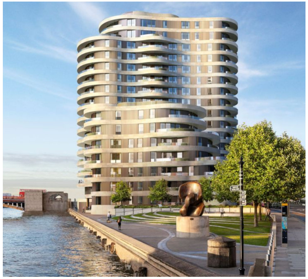
Riverwalk features two organically shaped buildings of 7 and 17 storeys