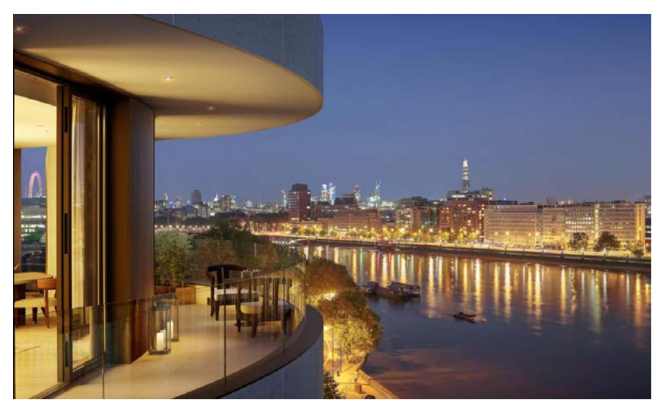
Exceptional views across the River Thames