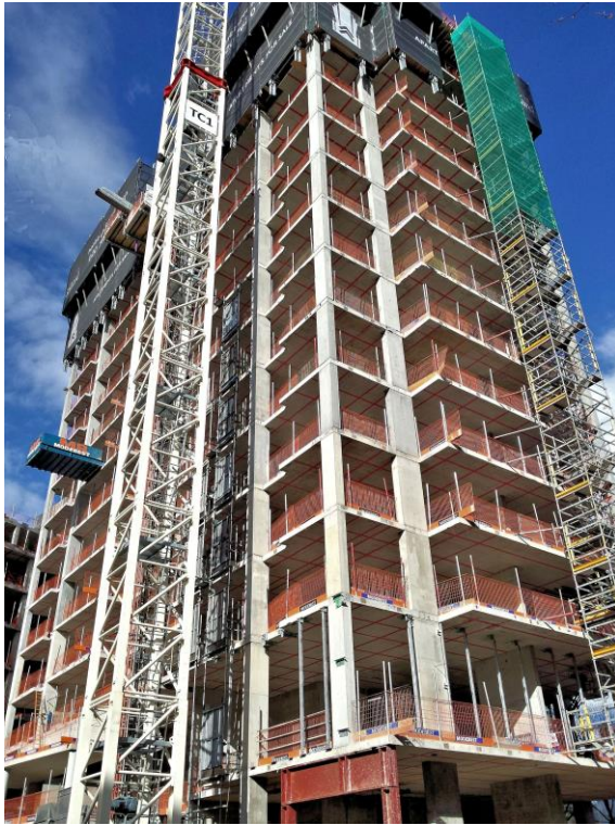
Work in progress.