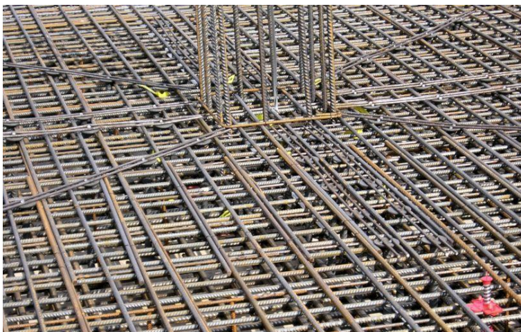
Bole on site and in position.